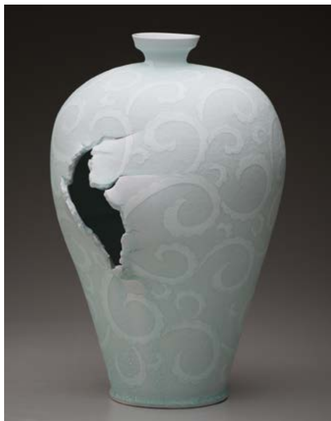
Cover: Beth Lo's Red Vase , 18 in. (46 cm) in height, porcelain, 2017.